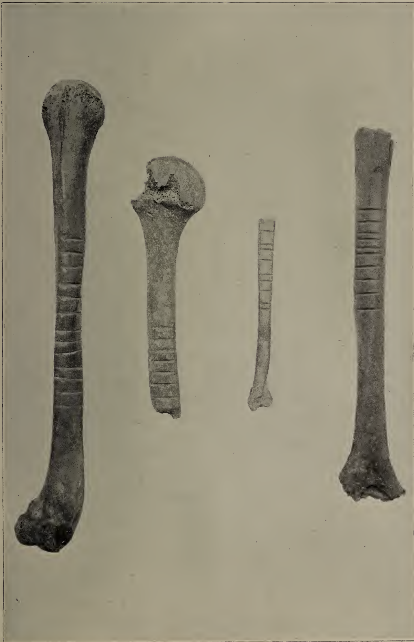
MARKED HUMERI AND FIBULA.